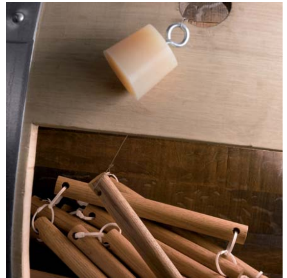
Silicone bung included

For full development of CENOSTICK® qualities, the sanitary conditions of the barrels must be optimal, with rigorous tartrate removal and kept free from microbiological or chemical contamination.