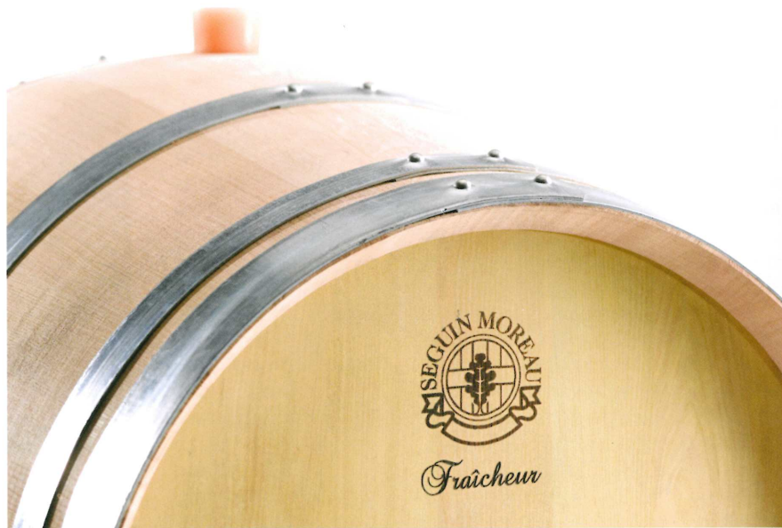
Seguin Moreau's Fraicheur barrel is a combination of French oak staves and acacia heads.

"A stylistic trend today for white wines, and even some red wines, is toward dialing back on oak," Jensen explained. "Winemakers want more fruit character and acacia can help with that. Stainless steel will also save fruit character, but you don't get the same structure and mouth-